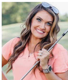
Lessons with Shirley Walker-Yeager Golf Course | Ask Instructor | Ages 6-100