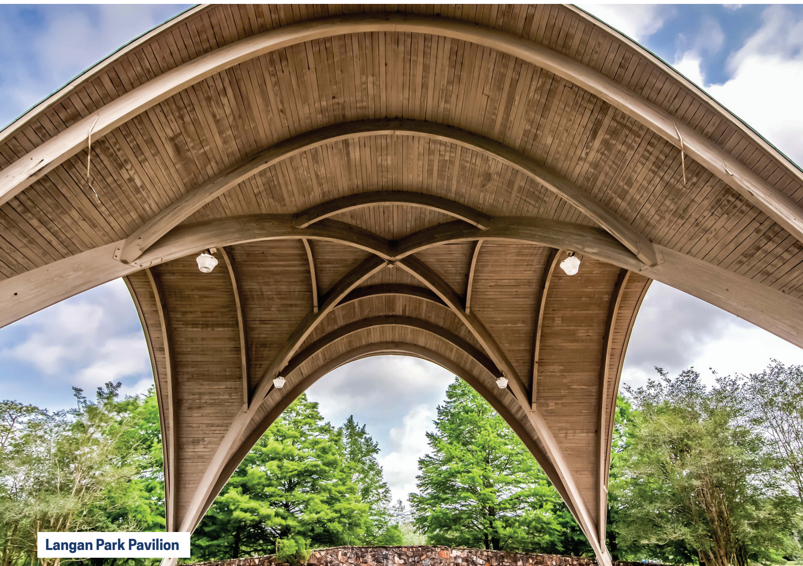
Langan Park Pavilion