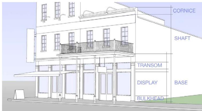
Figure A-10.1 Shopfront Elevation Elements

Cornice: Trim required at the eave or top of parapet. May include one or more habitable floors for buildings over 6 stories.